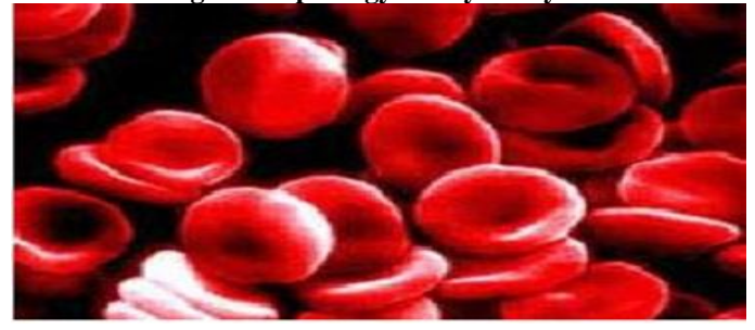
Fig 1. Morphology of Erythrocytes